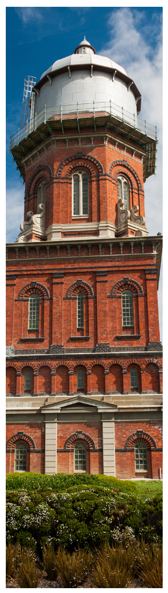
Water Tower, Invercargill

We are specialists when it comes to managing investment properties in Southland, and we look forward to working with you.